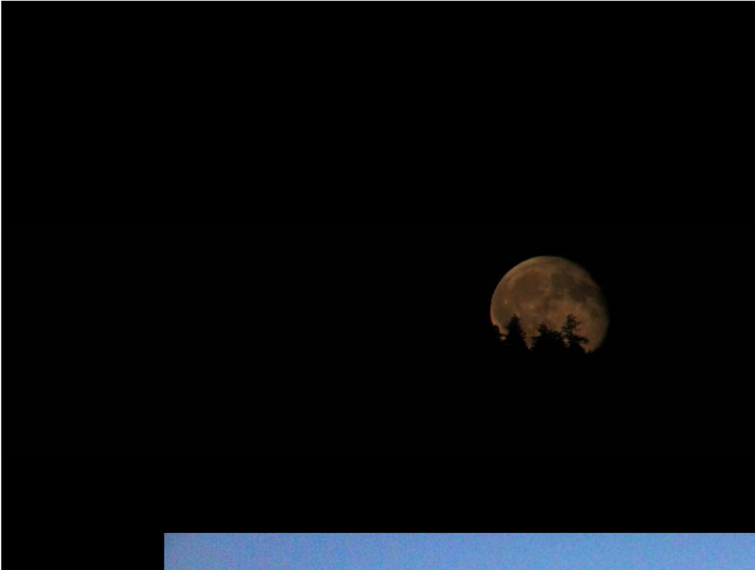
Digital camera set to manual with manual focus at infinity. 1/100 f/8 ISO 400 through 25x100 binoculars