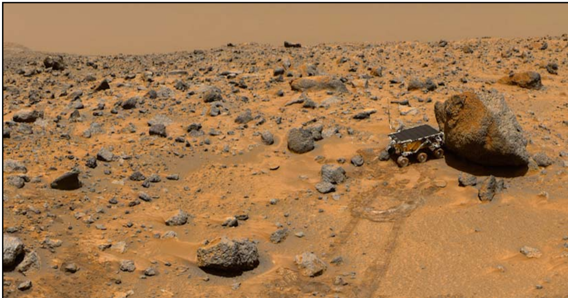
Caption: The Mars Pathfinder lander took this photo of its small rover, called Sojourner. Here, Sojourner is investigating a rock on Mars.

Learn more about the Sojourner rover at the NASA Space Place: https://spaceplace.nasa.gov/mars-sojourner