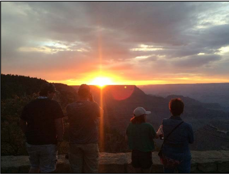
Sunset from Grandview Overlook

There were lots of ravens at the South Rim. When you left camp, it belonged to the birds. This guy was a bit more forward than most, waiting patiently to check things out when the coast was clear. The birds were so common that the park quoted the distance to the North Rim as 10 miles as the raven flies.