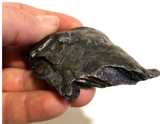
Sikhote-Alin 186g shrapnel in hand