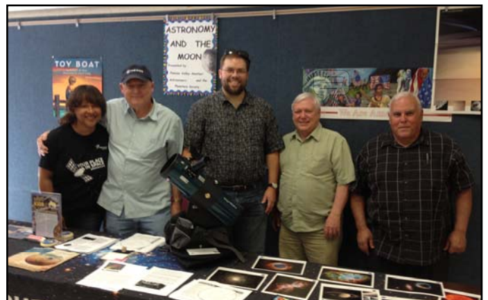
Claremont Public Library on Saturday, March 16