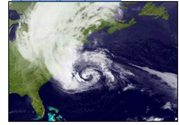
Did you know that some satellites keep an eye on space weather?

Every tropical cyclone (hurricanes and typhoons) in the history of tropical cyclones has spun counter-clockwise in the northern hemisphere and clockwise in the southern hemisphere. That's because of an important physics principle called the Coriolis Effect. It may be important, but it is still pretty weird and confusing. Learn all about it by reading SciJinks' latest article! http://scijinks.jpl.nasa.gov/coriolis.